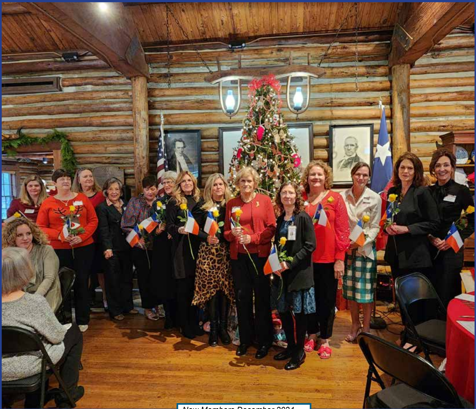
New Members December 2024