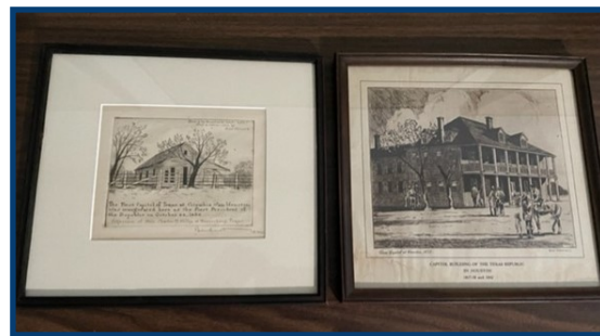
Capitols of Republic of Texas To Be Hung in Brooks Cottage