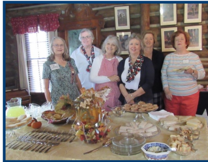
Chapter members with our beautiful refreshment table