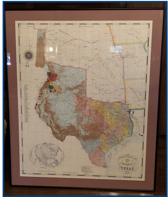
Beautiful framed map donated by Beth McCarty to our Chapter

We need you!! Please make sure you attend the November meeting as we will be voting on the proposed Bylaws amendments and we need a quorum in order to approve the changes!