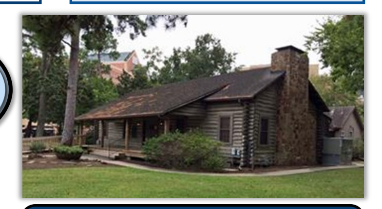
The view of our beautiful Log House building is improved with the removal of vegetation and the old fences and vines.

yearbook via mail! If you have not yet received your yearbook, please let us know!