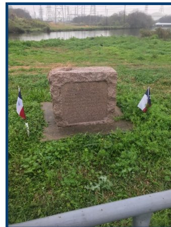
Vince's Bridge Boulder