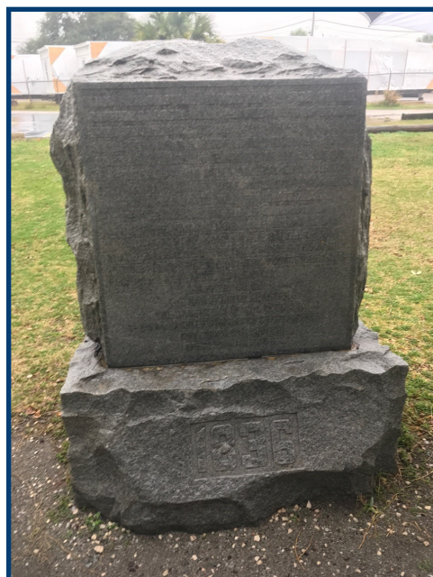
Boulder at Santa Ana capture site