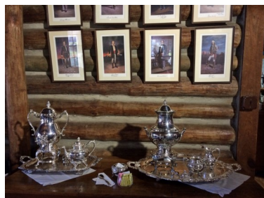
Photos of the Log House set up for Esther's Celebration of Life reception.