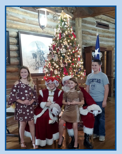
So much fun!!

Our Christmas Open House on December 5th was a huge success! Attendees met Santa and Mrs. Claus and many toys were collected for the Toy Drive. So much fun to see the Log House so festive and all of the attendees with big smiles on their faces. Happy Holidays!