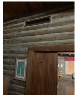
New Air Vents