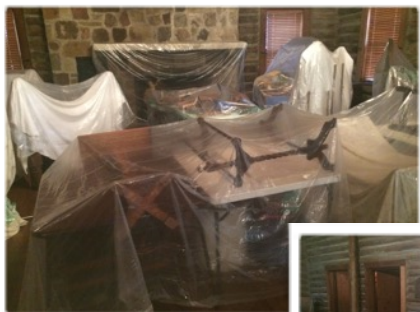
A "work in progress" to secure all items.

IF everything goes on schedule, we hope to have the repairs completed by our May meeting. Let's keep our fingers crossed that the work progresses smoothly!