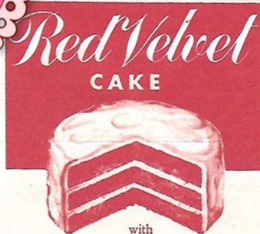
with "ADAMS BEST" VANILLA AND GOLDEN BUTTER FLAVOR

Many of you asked for the old timey Red Velvet Cake recipe from our February Valentine's meeting treats. Here ya go! Enjoy!