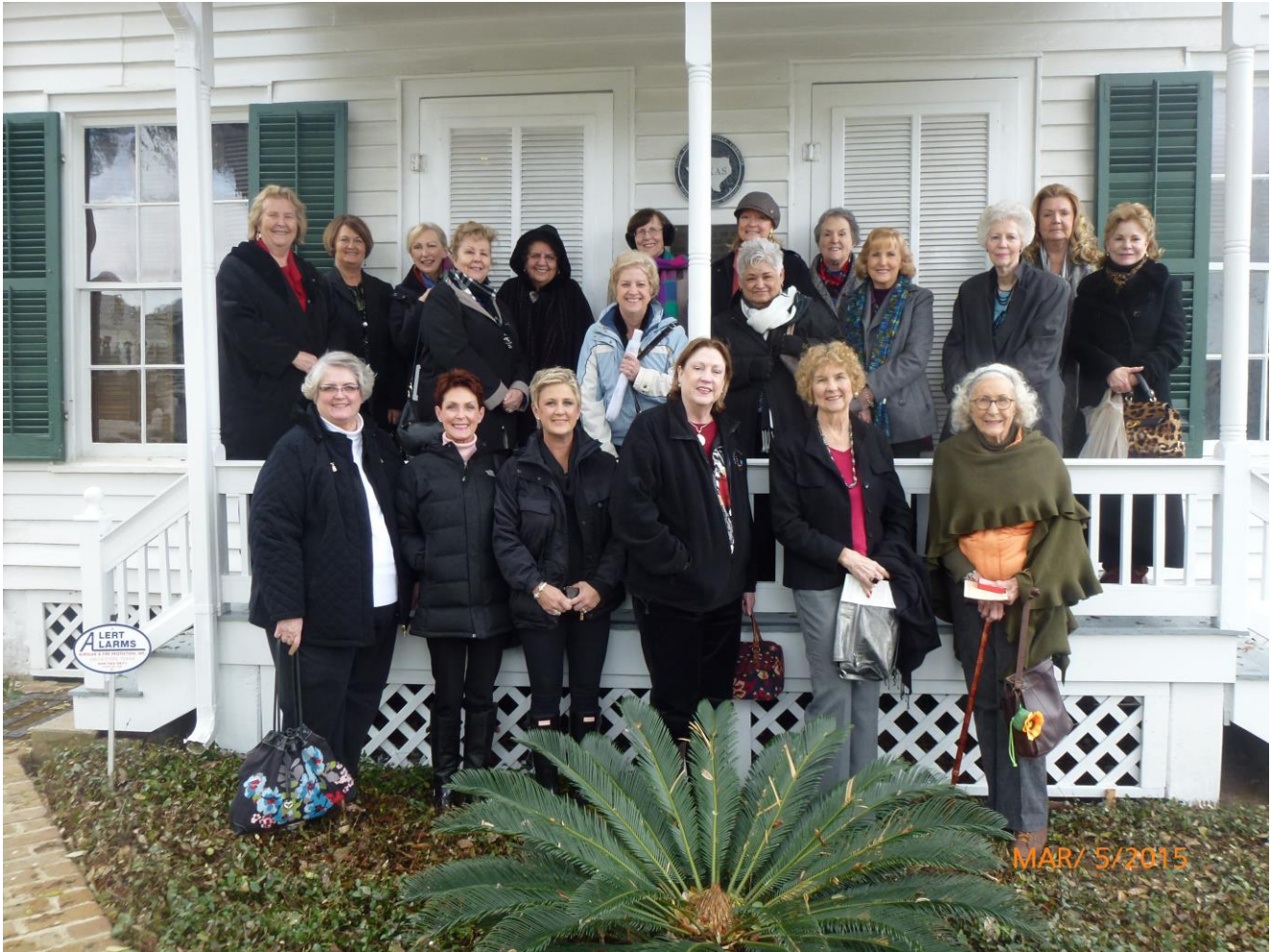
San Jacinto Chapter Members at The Cradle