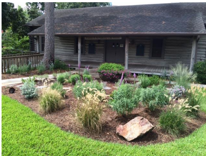
Pioneer Memorial Log House Museum and Pioneer Garden